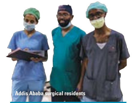
Addis Ababa surgical residents

A description of this new system was published in 2019 in Nanomedicine: Nanotechnology, Biology and Medicine .