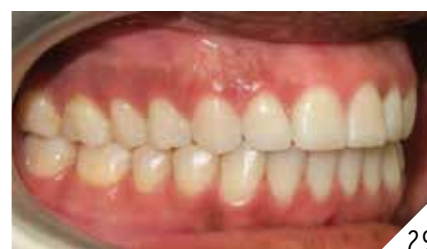
22. Postoperative lateral cephalometric radiograph. 23. Postoperative PA cephalometric radiograph. 24. Postoperative frontal view. 25. Postoperative maximal interincisal opening. 26. Lateral view 18 months postop. 27. Post treatment occlusion. 28. Post treatment occlusion. 29. Post treatment occlusion.

exhibit normal characteristics, although nuclear atypia may be observed. 8 Solitary osteochondromas, are cited to have an approximately a 1% risk of malignant transformation. 2